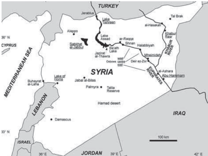
Figure 1. Map showing the position of Sabkhat al-Jabbul within Syria.

that the populations of wintering and breeding birds have increased over the last 10 years. Since 1991, when the sabkhat became officially protected under Syrian law, a number of uncoordinated conservation measures have been taken. However, these seem to be largely inadequate in view of the increasing threats facing the sabkhat that would severely compromise its value for wildlife and seriously impact on the livelihoods of the surrounding villages.