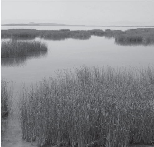
Plate 2. Rush Juncus sp at the northern shore of the central lake, May 06.