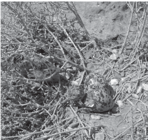
Plate 6. White-tailed Lapwing Vanellus leucurus chicks, southeast lake, 13 May 06.