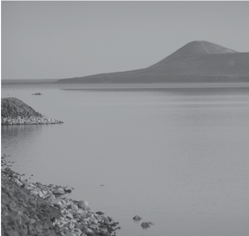
Plate 4. From NW Sabkhat al-Jabbul to Jabbrin tell, Feb 06.