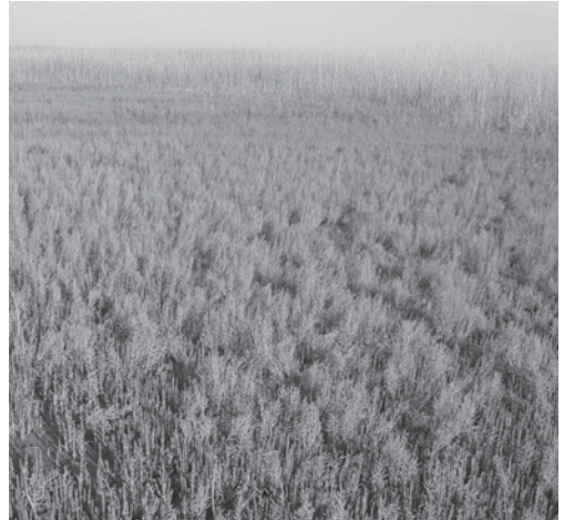
Plate 5. Halophyte vegetation on the eastern shore of the central lake.