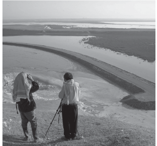
Plate 3. From Jabbrin island towards Hamra island across the dyke, May 06.