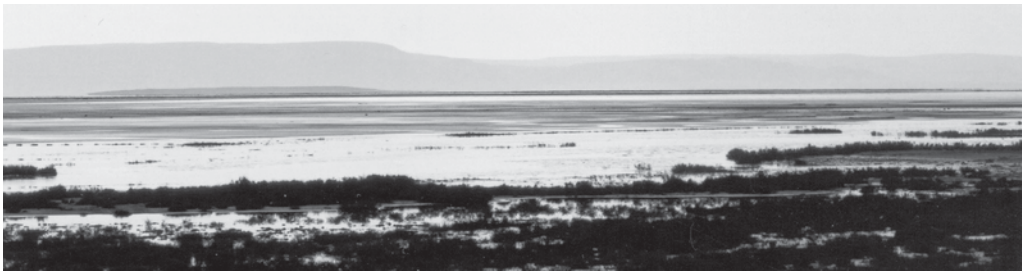
Plate 1. The central lake seen from the northeastern shore, Jebel al Hoss in the background.

Short halophytic communities supporting low biomass dominated the shores of the original saline sabkhat . The developments in agriculture and livestock over the last 15 years have led to major changes in the shoreline vegetation: