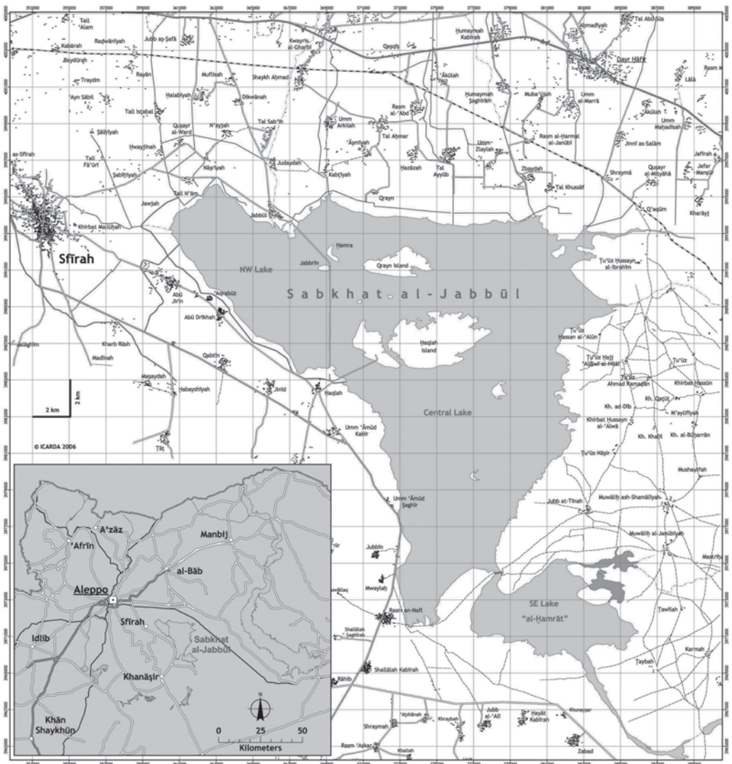
Figure 2. Map of Sabkhat al-Jabbul.