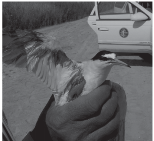
Plate 7. Shot Little Tern Sternula albifrons , May 06.